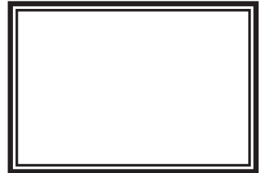
Dark Brown 20 Pfennig

During WWII, the Jews housed in the Łódź / Litzmannstadt ghetto formed their own postal service within the ghetto. In 1944, the Łódź ghetto became the only ghetto to publish its own postage stamps.