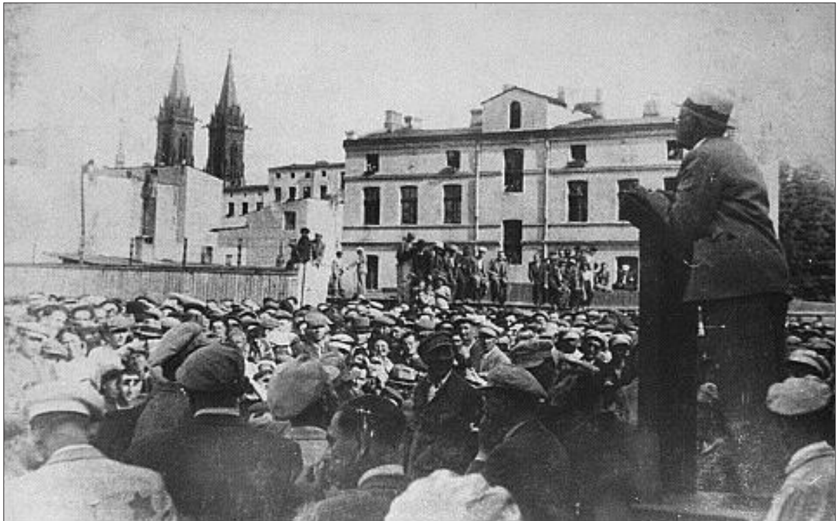
Mordechai Chaim Rumkowski delivering a speech in the ghetto, 1941-42

The stamps feature Mordechai Chaim Rumkowski, the Polish Jew selected by the Germans to head the Jewish administration within the ghetto.